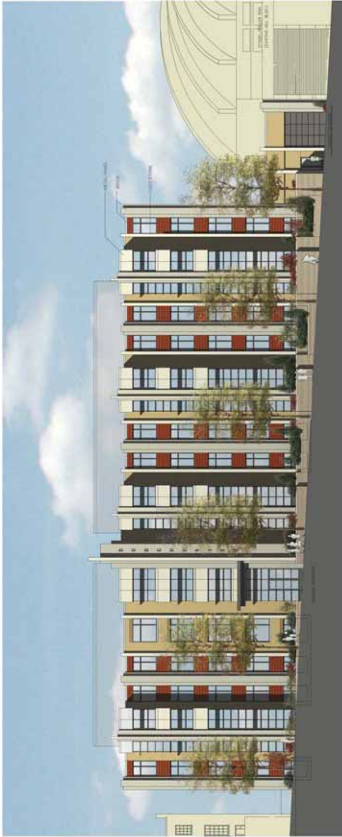
1 WEST ELEVATION SCALE: 1/8" = 1'-0"